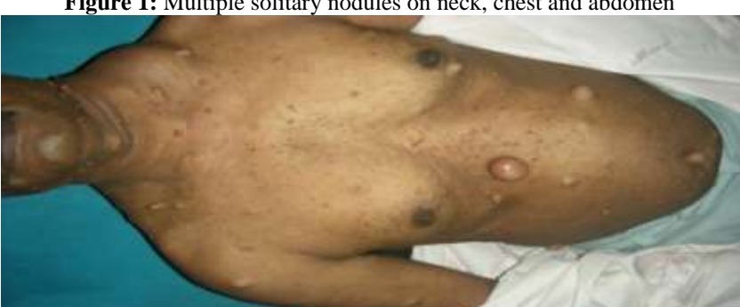
Figure 1: Multiple solitary nodules on neck, chest and abdomen